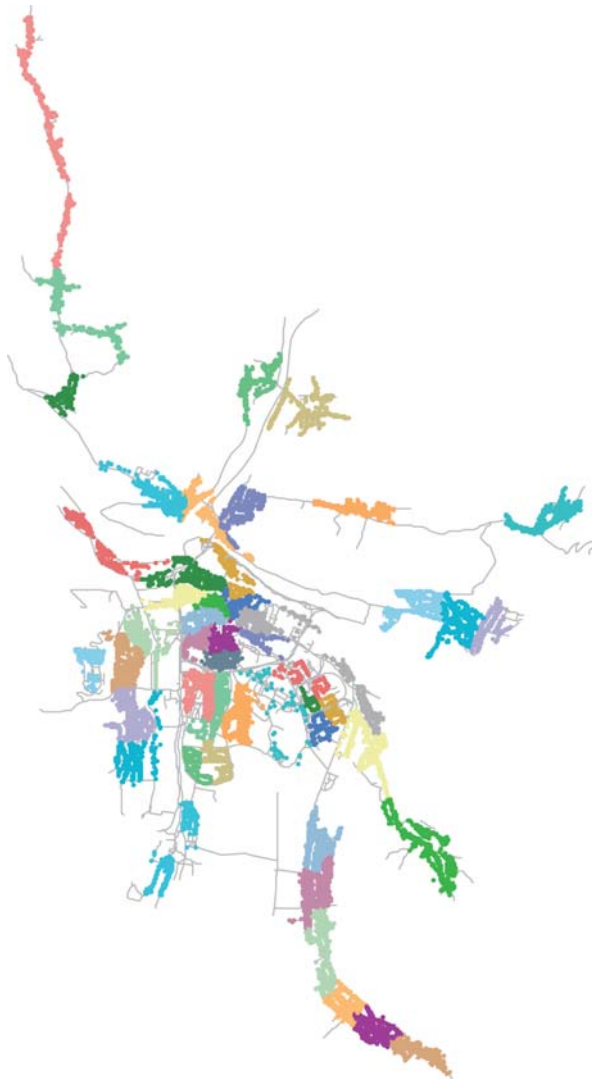
Fig. 2: Natural clusters in large Zilina region created by FCH

where SD is a total distance of all the street segments that are served by one postman. This formula was created from a simple regression using sample data with 125 service clusters compared to the best results from heuristics described by Matis [5]. Figure 2 represents use FCH in one large SRP case.