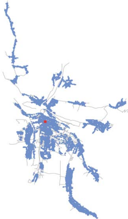
Fig. 1: Customers and depot in large Zilina region

service and at the end of the working day they can be driven back to the depot. Deliveries are made on foot, so the problem represents a special case of SRP with a mixed transportation mode. The car driver is also a postman and serves one district. There are no transportation related expenses. The delivery time is limited for each postman. Time gaps between the physical end of deliveries and the car arrival to drive the postman back should be tide.