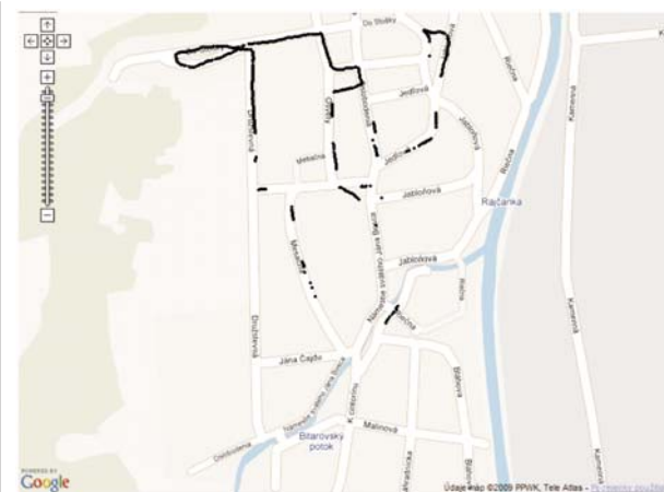
Fig. 4 Radio map database filtered for BS with CID=4F81, BSIC=29 and BCCH=15

The development of fingerprinting online phase component would enable radio map framework to become usable service-oriented solution for localization in GSM networks.