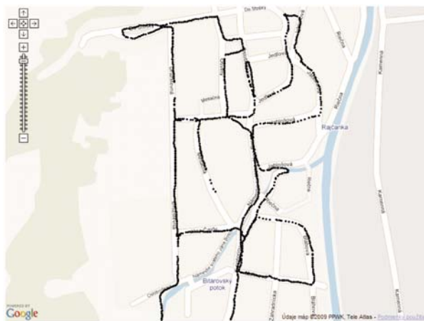
Fig. 3 Radio map database with all spots

It allows displaying of all spots from radio database at once as shown in Fig. 3. Spots are shown as black dots.