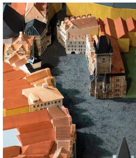
Fig. 1: Model of the Old Town Square in the aerodynamic tunnel