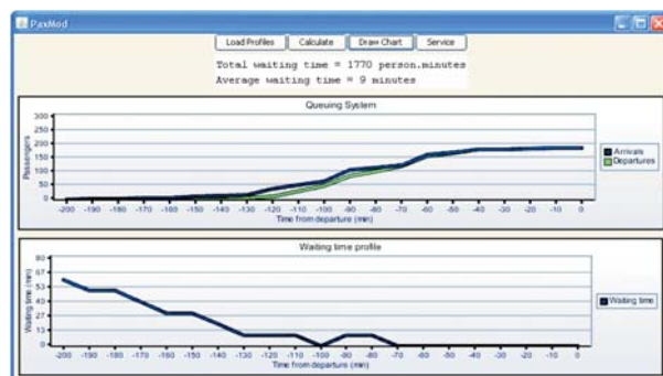
Fig 1 Evolution of passenger arrivals, departures and waiting times at the Check-in (screen shot from PaxMod).