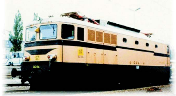
Fig. 4 The electric locomotive series 342

The fourth (four axles B'_0 B'_0 ) locomotive of the DC System 3 kV, series 342 was manufactured by Ansaldo Italy and has been operating in the region of Slovenian Railways since the year 1968 (Fig. 4). The next (six axles B'_0 B'_0 B'_0 ) DC system locomotive series 362 was also manufactured by Ansaldo Italy and has been already operating in Slovenia since the year 1960 (Fig. 5). The French locomotive (six axles C' C' ) series 363 has been operating in Slovenia since the year 1975 and is still representing the most frequent electric locomotive on the Slovenian railways today (Fig. 6). In