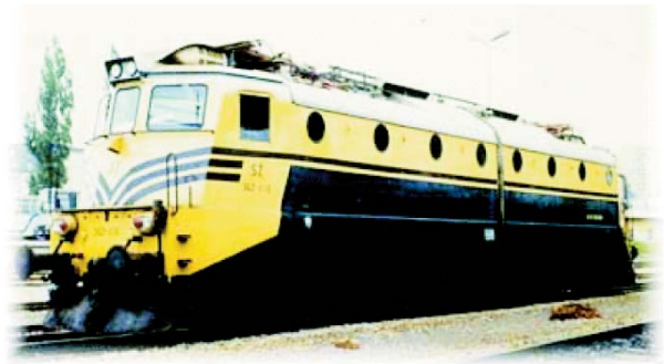
Fig. 5 The electric locomotive series 362