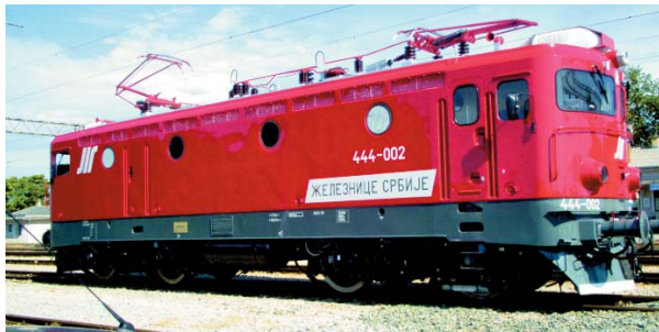
Fig. 2 The electric locomotive series 444