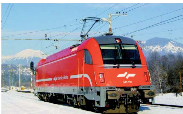
Fig. 7 The electric locomotive series 541