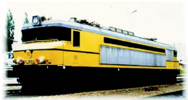
Fig. 6 The electric locomotive series 363