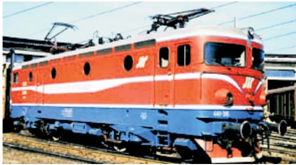
Fig. 1 The electric locomotive series 441

high unification of equipment on locomotives of series 441 and 461 and maintenance cost reduction. Total number of locomotive series 441 is 76 (441: 46, 444: 30) and of series 461 is 53.