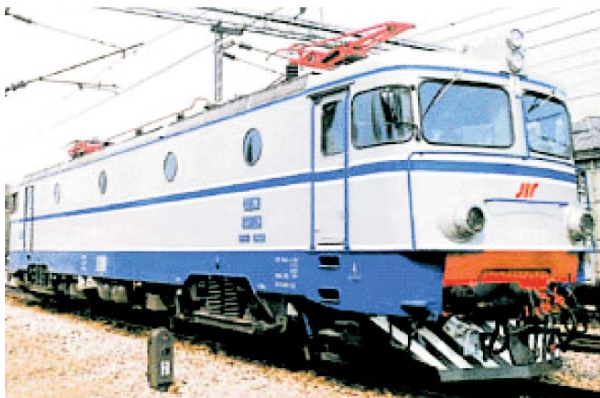
Fig. 3 The electric locomotive series 461

The fourth (four axles B'_0 B'_0 ) locomotive of the DC System 3 kV, series 342 was manufactured by Ansaldo Italy and has been operating in the region of Slovenian Railways since the year 1968 (Fig. 4). The next (six axles B'_0 B'_0 B'_0 ) DC system locomotive series 362 was also manufactured by Ansaldo Italy and has been already operating in Slovenia since the year 1960 (Fig. 5). The French locomotive (six axles C' C' ) series 363 has been operating in Slovenia since the year 1975 and is still representing the most frequent electric locomotive on the Slovenian railways today (Fig. 6). In