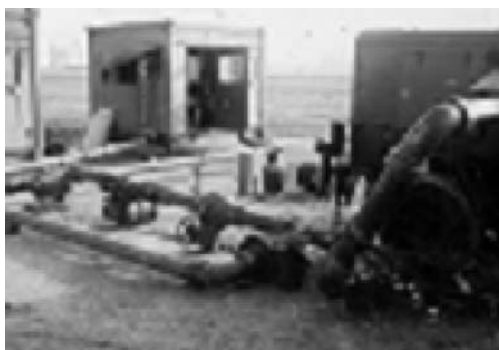
Fig. 2. Military pipeline equipment.

These are general stages of managerial activities in pipe transport: