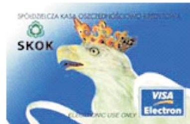
Fig. 4. Design of VISA Electron payment card

Since autumn 2002, when cooperative unions were connected to the new ELIXIR system of inter banking settlements, they offer the settlement bank products (encompassing current accounts and VISA Electron payment cards, see Figure 4).