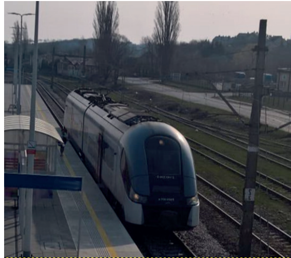
Figure 2 EN96 during course