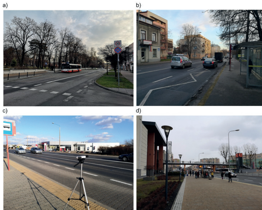
Figure 2 Location of the measuring zones: a) center zone "30", b) downtown c) access road to the center - city beltway, d) downtown - shopping mall

L_i - sound level over a period of time,