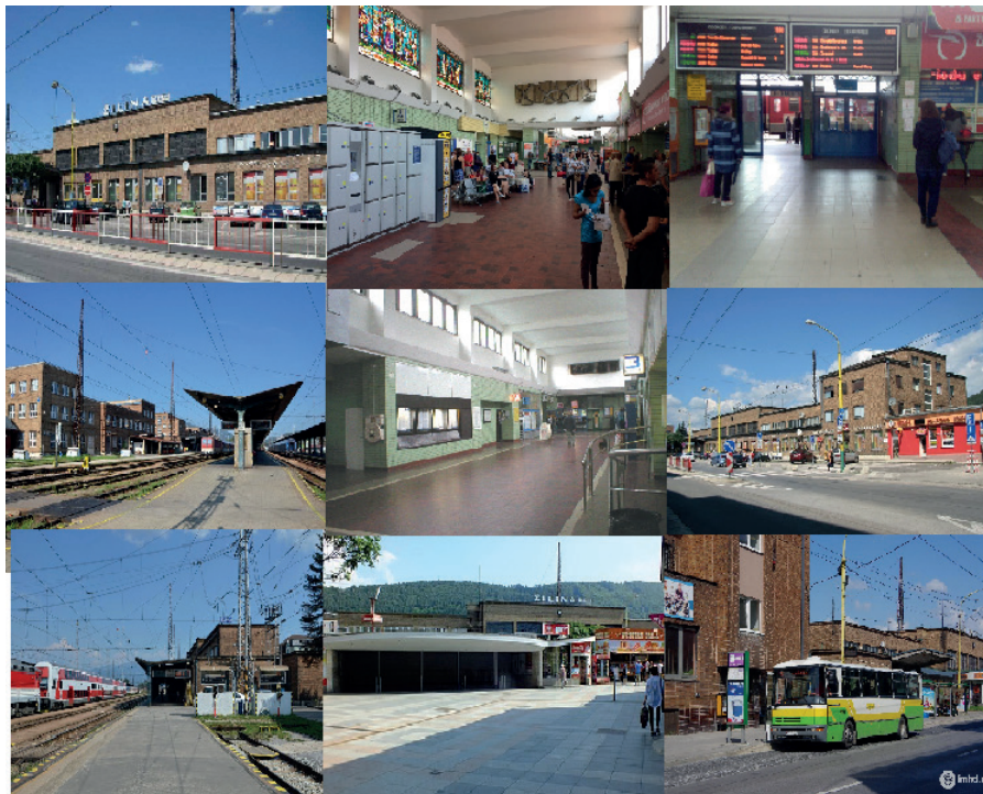
Figure 2 Indoor and outdoor environment of the Zilina railway station [37]