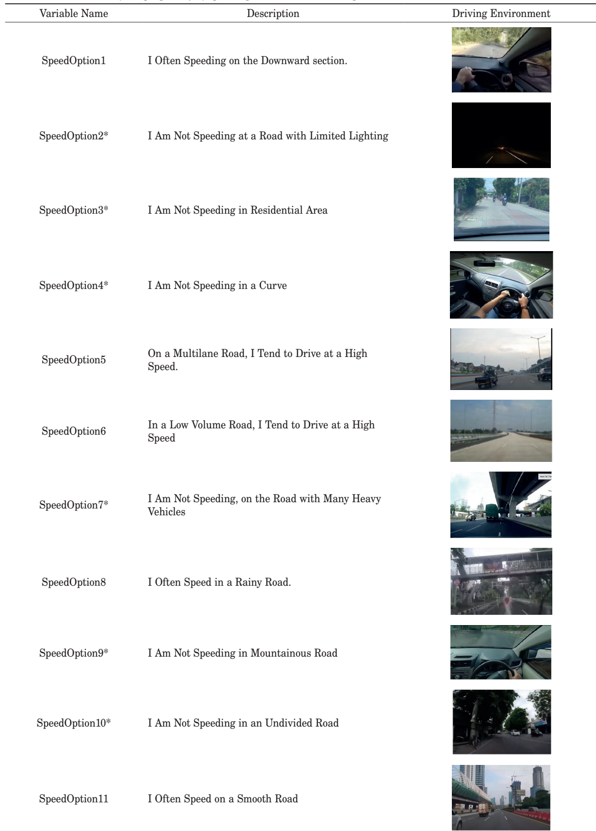
Table 1 Measurement of the propensity of speeding under certain driving environment

* Item indicated by (*) means reverse question (item with different direction with other items)