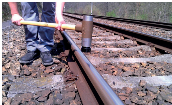
Fig. 2 The test in-situ, impact excitation