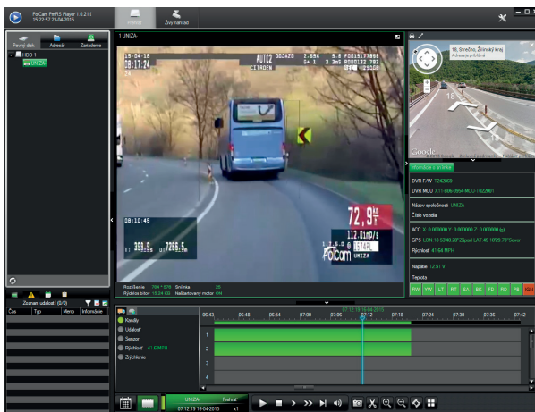
Fig. 3 SW Polcam Playback connected with Google Street View

It is used to playback, edit and evaluate the records, preparation of speed measuring proofs, or for other regulation breaks in road traffic. The programme Polcam Playback is connected to Google maps, in particular with Google Street View. The advantage of this connection is a 3D projection of the respective road section (Fig. 3).