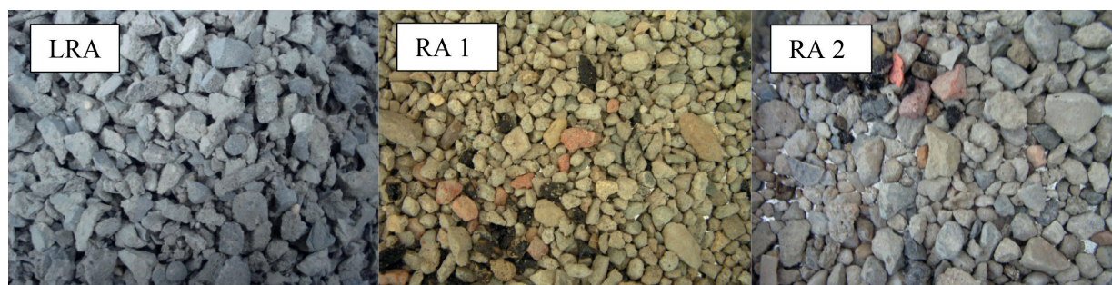
Fig. 1 Used recycled aggregates