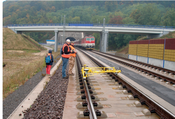
Fig. 1 Type of Ballastless Track Construction RHEDA 2000

For monitoring the ballastless track, the digital precise levelling was applied in both measurements to control the vertical stability of the reference network and track construction.