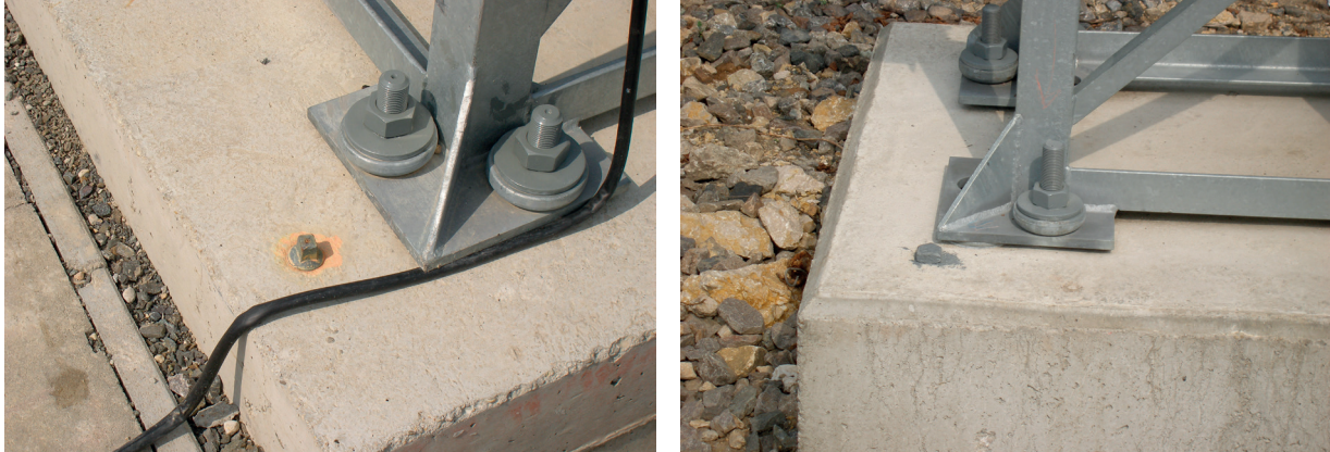
Fig. 2 Benchmarks of Vertical Reference Network