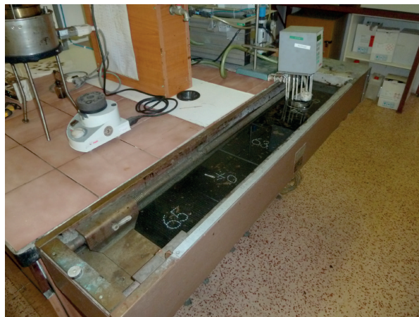
Fig. 3 Water bath according to [2], [3] for the specimens.