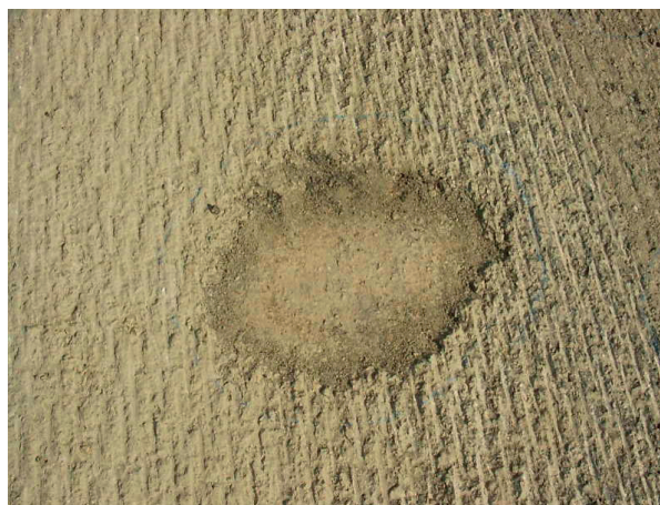
Fig. 1 Buckling under milled protective layer and surface course.

absorption a particular BWS reaches. The term weight absorption is hereinafter referred to as absorption.