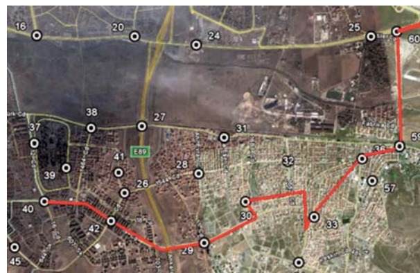
Fig. 2 The route formed by the nodes 40, 42, 29, 30, 33, 36 and 60. In the map, the nodes 16–20–24–25–60 is on the major highway that leads to the destination points

For constructing the routes, the departure points of the current transportation system were used as they are. The destination points are already few and well established. Therefore the routes are constructed considering the existing departure points and destinations. All routes are in the form of round-trips. Furthermore, the concerns of the municipality were taken into consideration. For instance, a route should be as straight and short as possible, in that the distance of a route is at most 120% of the distance that can be traveled over in same time period. A round trip of a route should be completed in at most two hours. In Fig. 2 we show part of a route that covers the major portion of the residential areas. The remaining part (which is not shown) follows a highway directly to the destinations.