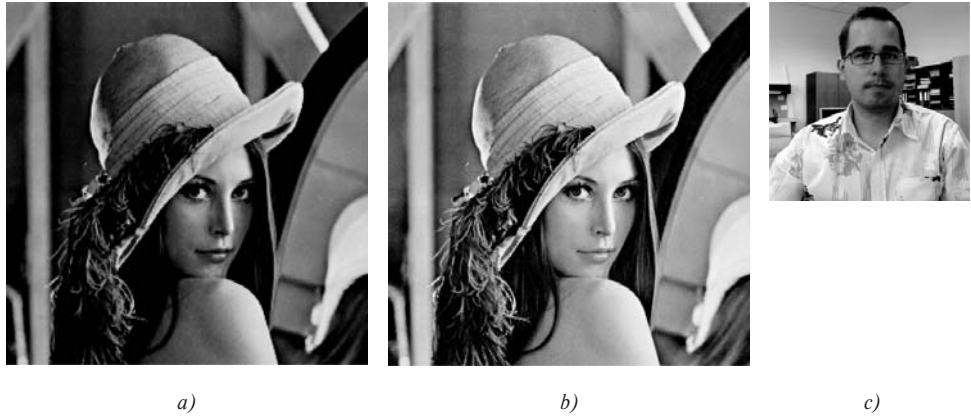
Fig. 3 a) Lenna original, b) Lenna - watermarked image, c) Watermark

attacks. The image Lenna (Fig. 3a) as the original image I and the image of face (Fig. 3c) as the watermark image were used to test the proposed methods. The scale factor 0.16 was used as a trade-off between watermark invisibility and robustness. The differences between the original and the watermarked image are shown in Figs. 3a) and 3b). The watermarked image (Fig. 3b) has notably different brightness than the original image (Fig. 3a).