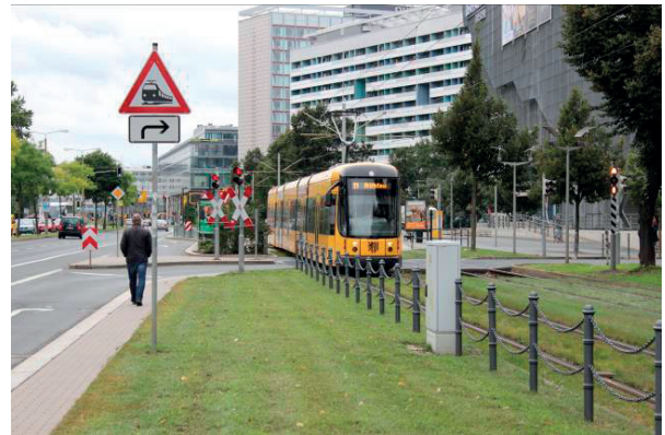
Fig. 4 Unsignalized intersection on Vajnorska branch and "railway crossing" in Dresden/Germany