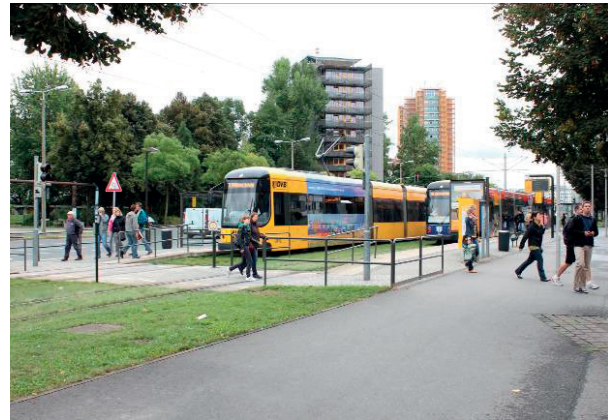
Fig. 3 Station in Bratislava without any passenger guiding system and insufficient waiting capacity, best practice station design in Dresden/Germany