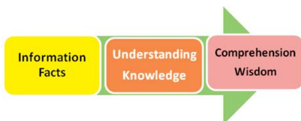
Fig. 3 The scheme of cognitive process

Mathematics is a specific subject. To have a number of relevant information, to know the facts or isolated terms, to recall mathematical sentences, definitions or formulas is only the first step. The cardinal necessity is to understand their mutual context, which is the only source of true knowledge also applicable in reality.