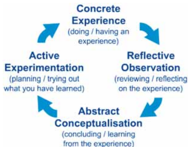
Fig. 1 Kolb's learning model [10]

Acquiring leadership competencies based on personal experience involve the use of all experiences, in families, peer groups, schools, and those obtained in meetings with other leaders and their own professional and leadership experience. Even the experience of young people is a great treasure of information, values and