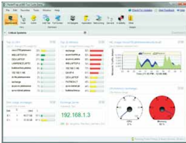
Fig. 4 Example of dashboard interface of PacketTrap pt360

tions. They were created with the business top executives in mind. There were two technology developments in business organizations that become enablers for affordable development of the ED systems: centralized data warehouses populated with large volumes of real-time data, and the development of the intranets based on WWW technology. The practical value of the dashboard systems became evident when they were made available for the greater number of the decision makers in the organization, not only top executives.