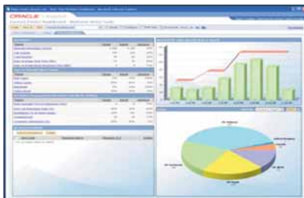
Fig. 2 Interface example of Oracle/PeopleSoft Enterprise Service Dashboard

The EDs originated as an application of information technology (IT) for decision support in the context of business organiza-