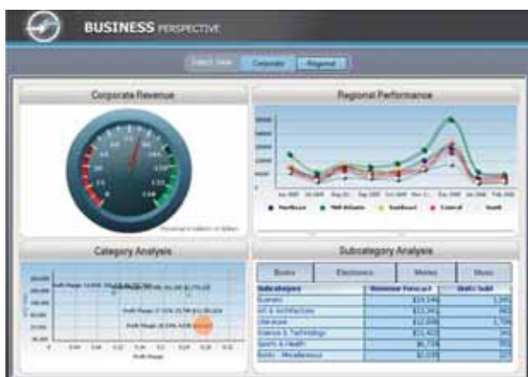
Fig. 3 Example of business dashboard interface MicroStrategy 8.1