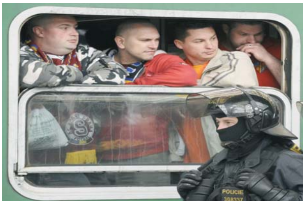
Fig. 2 Fans accompanied by police officers are leaving Ostrava against their will [2]

Safety measure is directed by a Commander, who controls the staff. Both the Commander and the staff are chosen by order of the Chief of Police or the Chief of Regional Headquarters. According to its purpose, safety measure is usually performed by members of IRS units or members of various services of the Police of the Czech Republic available in the location.