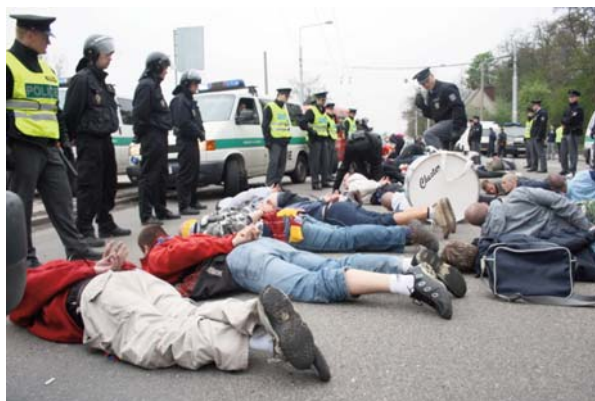
Fig. 1 The fans of the visiting team are handcuffed for having repeatedly refused the orders of the police [1]

Such procedure taken by the Police of the Moravian-Silesian region represented a clear message to football fans – the police are able to supervise and accompany fans securely to the so-called “hazardous matches”, so that common traffic and order in cities are not at risk (the police design routes through which, with the assistance from ACT members, the fans are directed). Understandably, the police also ensure security of the fans, so that fights among the fans of the two different teams are prevented. The police are ready to use forces and means needed to suppress any aggressive behaviour of the fans, who, when drunk, often irrationally seek to struggle with the police officers. From my personal experience,