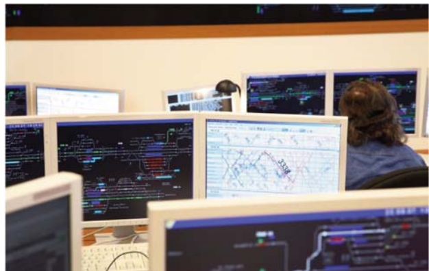
Fig. 6 View of dispatcher workplace in dispatcher room