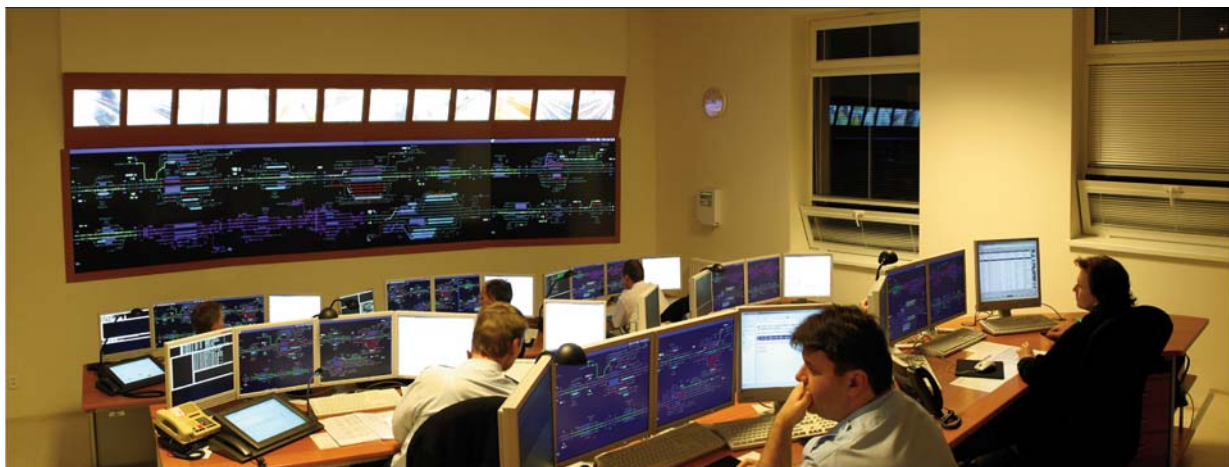
Fig. 1 CDP Prerov, Large dispatcher's room No. 1 – General view of the dispatcher and operator centralised control place

By 'control' we mean the possibility of organizing traffic by means of determining the train runs order, their overtaking, using station and track rails etc. At the centralized dispatcher places (CDP), the controlling process is connected directly to the electronic interlocking control, or stations security signalling equipment